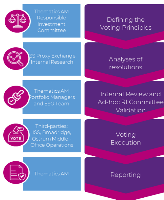
Thematics Asset Management Voting process